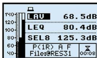
SLM results in 3-profiles view