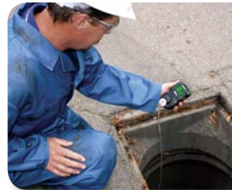
QRAE II Pump being used for a confined space entry

SPE O 2 ™ sensor designed to meet RoHS directive