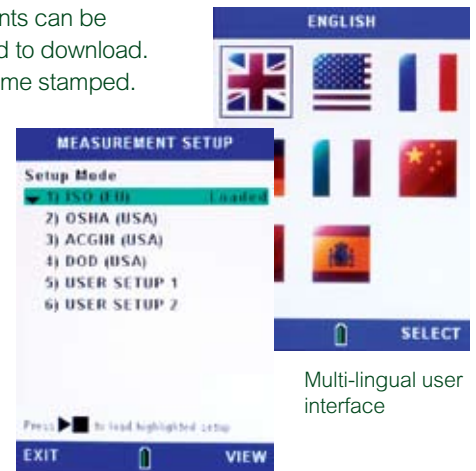
Multi-lingual user interface

When connected to a PC via the USB connection, the CEL-600 series acts like a memory card, so data files can be moved to a PC and easily reviewed without the need for proprietary software.